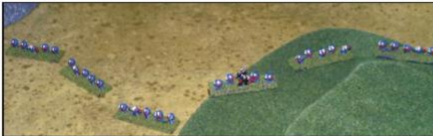
This squad is in coherency

Units that contain creatures that regenerate or are otherwise not immediately removed when they are hit and fail their save do not need to continue to observe coherency with these models – they are considered eliminated until the End Phase. If a creature regenerates and is out of coherency then the entire detachment must move so as to be in coherency at the end of the next Movement Phase.