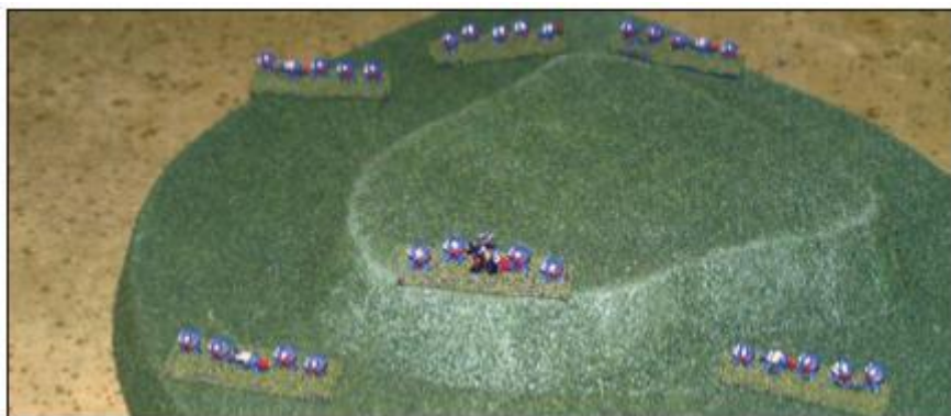
This squad is out of coherency, even though every model is within 6 cm of another one.